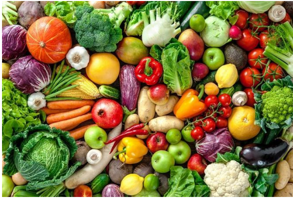
An Unoptimized Image

Look at the two images below — while they look exactly the same, only one of the images is optimized for search engine optimization.